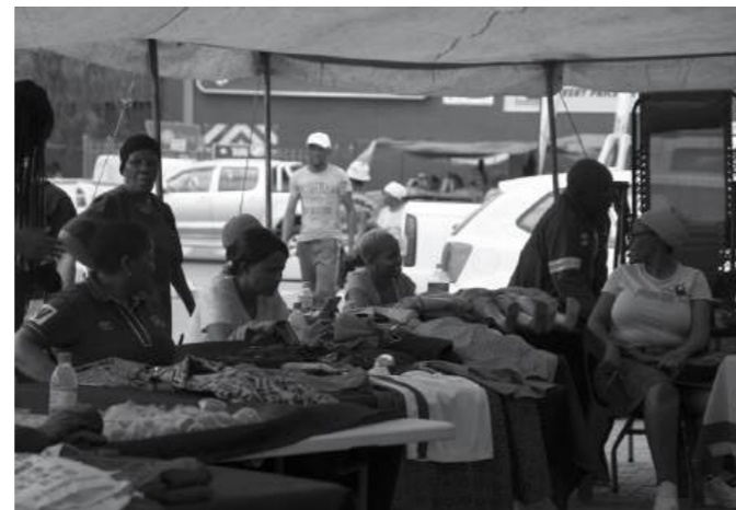
Pop Market Event

Residents of Taung were present to witness talent and abilities of SMMEs who brought a variety of products and services to exhibit. Many small businesses used the opportunity to promote clothing products. These were mostly school uniform, tracksuit and traditional clothes. There were more than 20 clients to showcase selling products and services. Other products/services included seasonal local produce, resources, food, entertainment and artists.