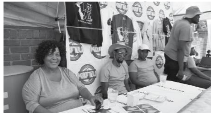
Pop up market exhibitors

The Small Enterprise Development Agency (SEDA) is an agency of the Department of Small Business Development (DSBD) which provides non-financial support to small enterprises and cooperatives. SEDA recently worked with Dr RSM District Municipality to coordinate the pop-up market in Taung. The pop-up market is an initiative which seeks to provide access and exposure to the local market for small, micro and medium enterprises (SMME).