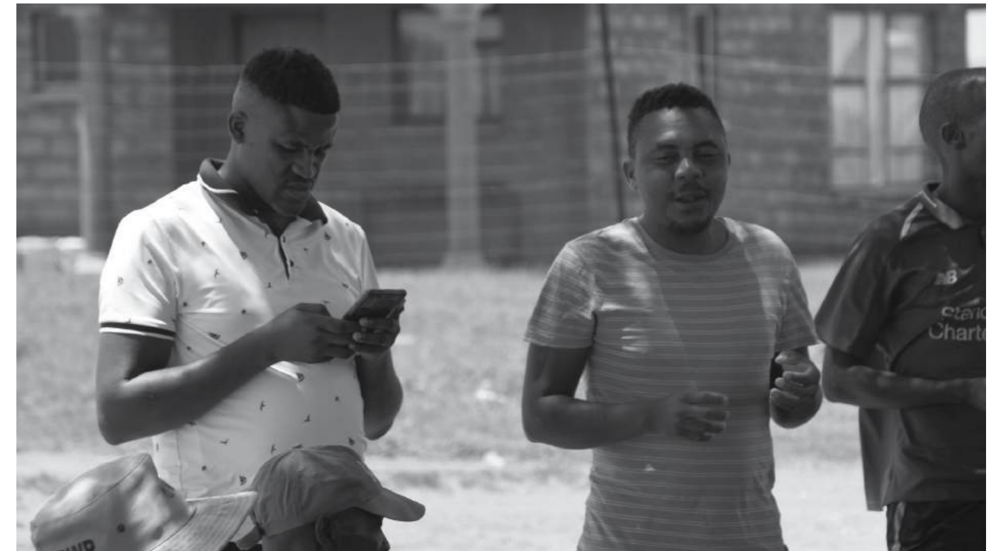
Mayor's engagement with the media

The Municipality is therefore delighted to share pictures on the progress on this road, which is being constructed in collaboration with the Department of Public Works and Roads.