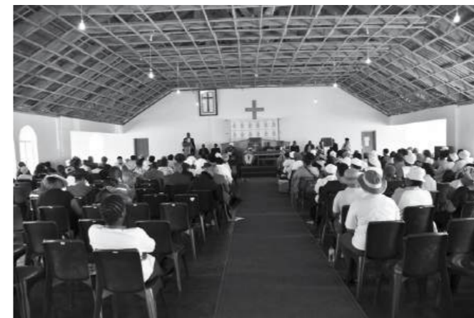
Attendees at the Road Safety Prayer Session