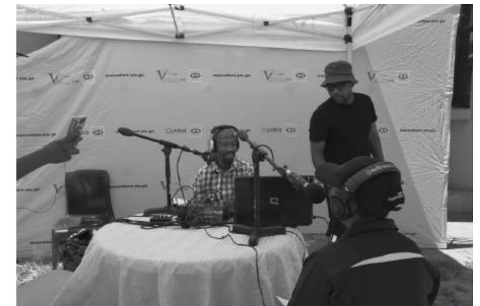
Vaaltar FM Outside Broadcast

This initiative is so important, especially for our learners, they become exposed to career options and subject groupings from as early as grade 10. Our youth are not challenging themselves from risking their lives for what they will benefit from. One of the things indicated about Taung was, Taung is known as a highest in birth rate and low in death rate even the statistics can testify but the most concern was relocation to youth.