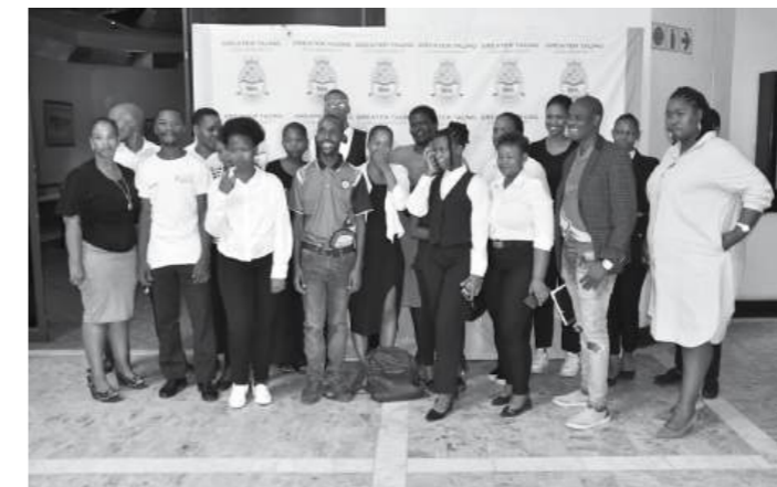
Taung Hotel School Students