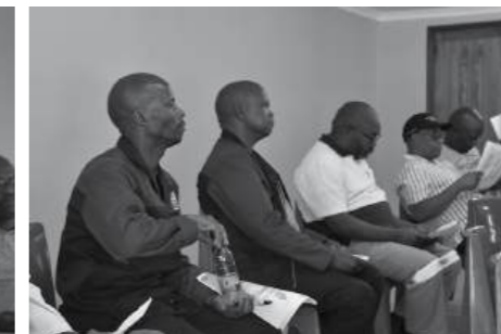
Cllrs. and representatives of various sector departments