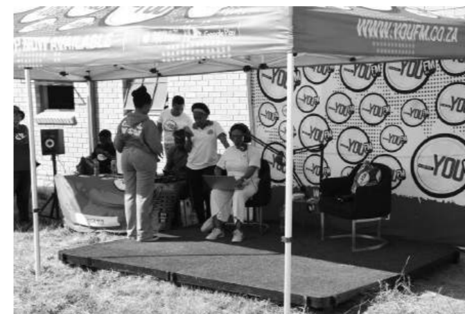
Thuntsha Lerole Attendees

The key focus of the Integrated Service Delivery Programme at Lower Majakgoro was to monitor the implementation of road construction project (infrastructure project) in the area.