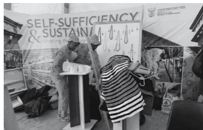
Correctional Services Imbizo

Community members and victims of convicts were given the opportunity to engage with offenders. Offenders undergo rehabilitation and reintegration processes whose main purpose is for them to change their behaviour and have the chance to live among community members who may have been hurt due to offenders' actions. The process of engagement between offenders and victims/affected families involves apology from offenders which should lead to closure on the part of the victims and affected families.