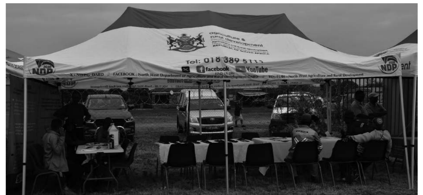
Thuntsha Lerole Attendees