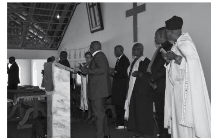
Ministers and Preachers at the Road Safety Prayer Session