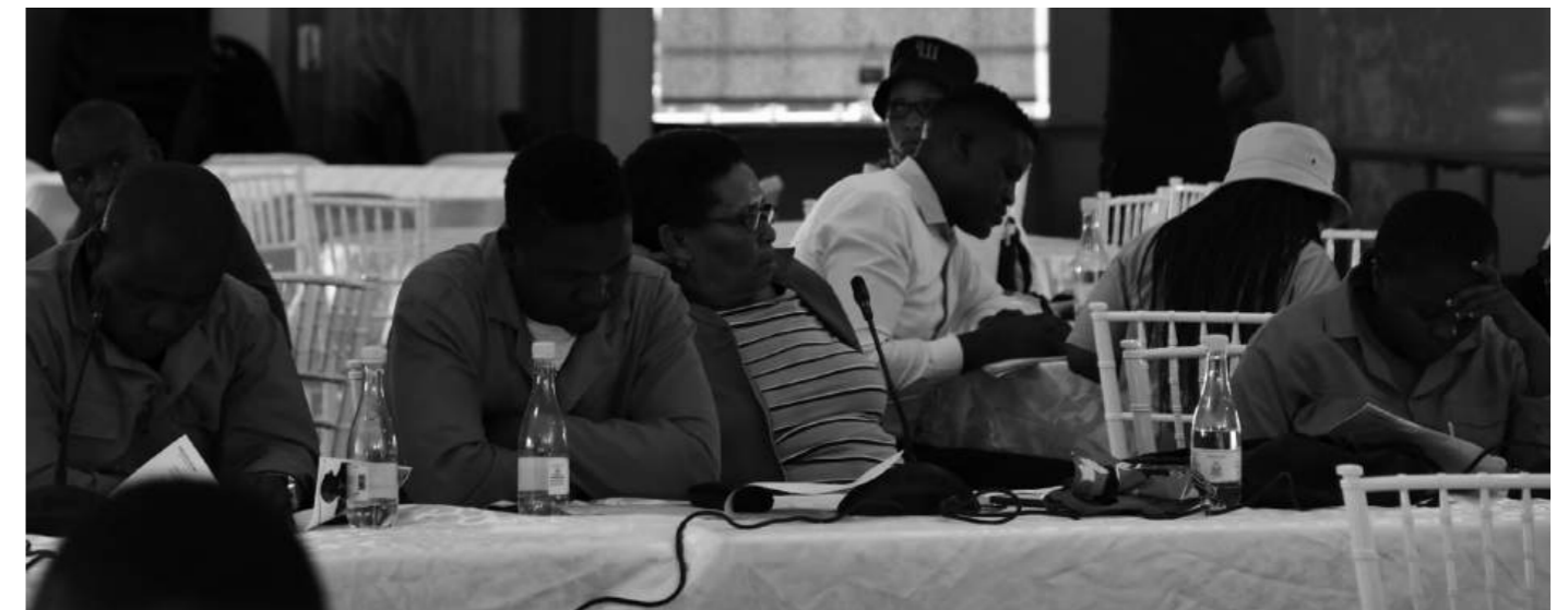
Audience at the Mayoral Budget Speech