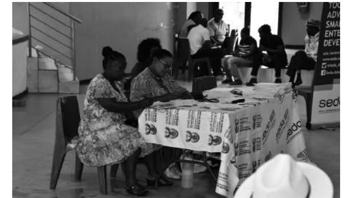
MMC of LED, Cllr. Sebe and Government Officials