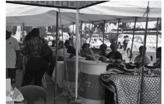
Pop up Market Event

Representative of SEDA explained that the Agency aims to do more in the future than just markets. Plans include educating, informing, inspiring and motivating people within the black business in Taung to work hard and grow their businesses.