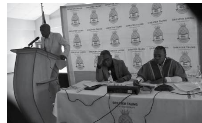
The Mayor Presenting Budget for 2024/25 Financial Year

The Mayor started in his address by reflecting on water shortage challenge in Greater Taung as a whole