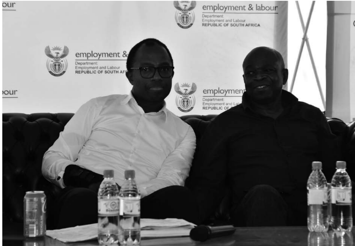
Employment and Labour Officials