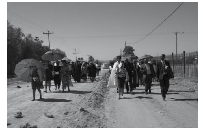
Marching to Kgomotso Main Road for Prayers