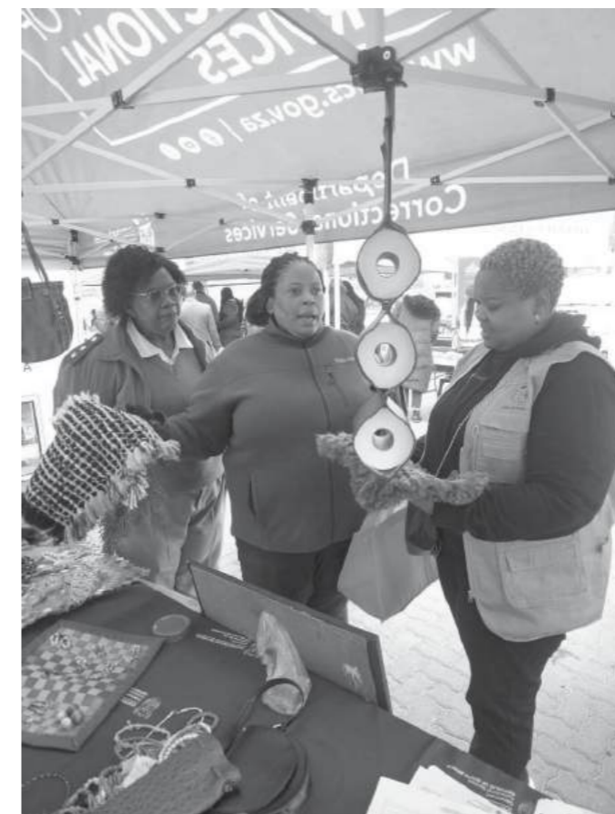
Exhibitions at the Correctional Services Imbizo