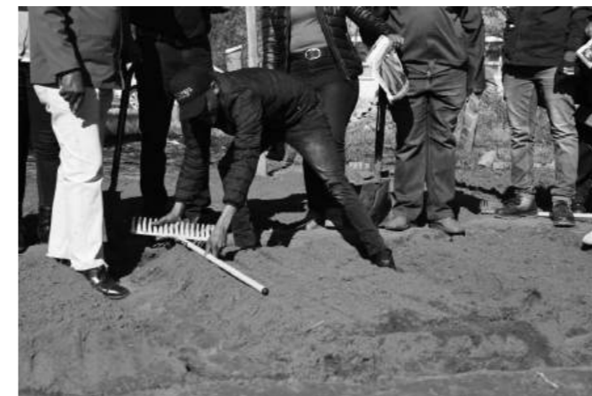
The Mayor spent his 67 Minutes Working at Taung Hospital Vegetable Garden