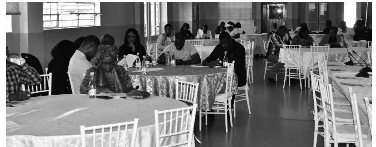
Audience at the Mayoral Budget Speech