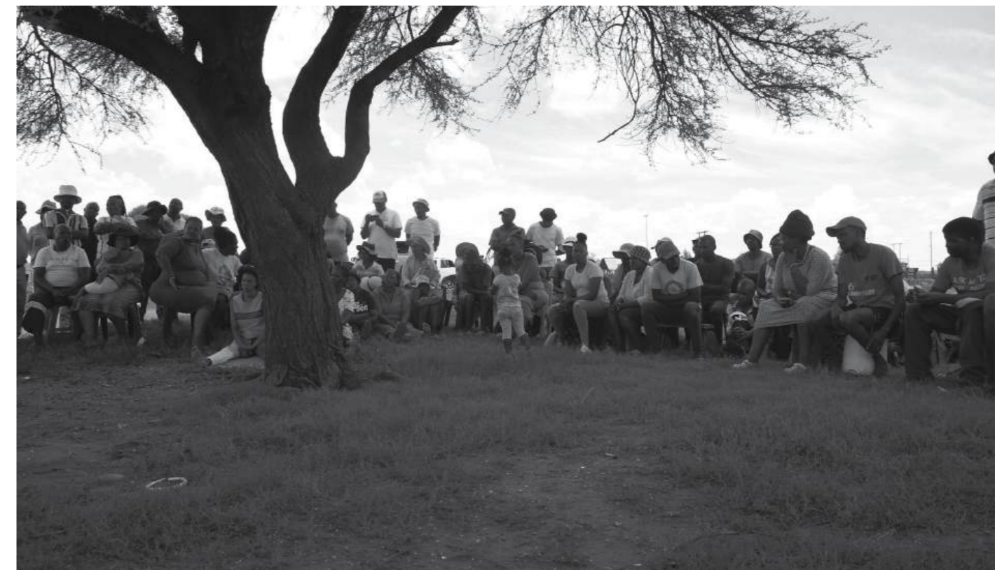
Community members of Itireleng