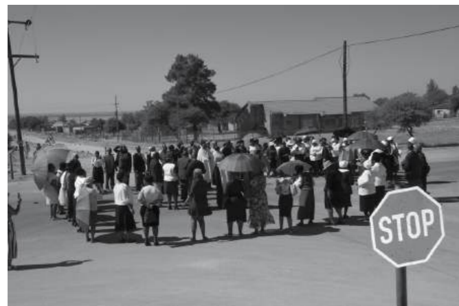
Prayer at the Kgomotso Main Road