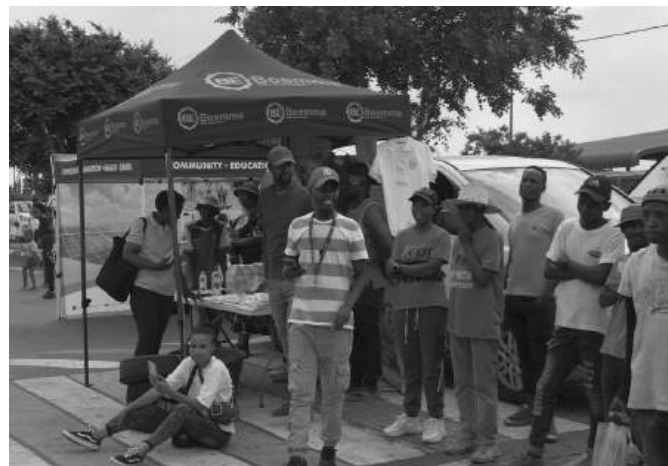
Young people at the pop-up market

The importance of pop-up market is to create a new touch point with customers and engage with them in a unique way without having to fully invest in a new store or location. Attending pop-up markets creates brand awareness and as result attracts customers from all parts of Taung as well as across the country.