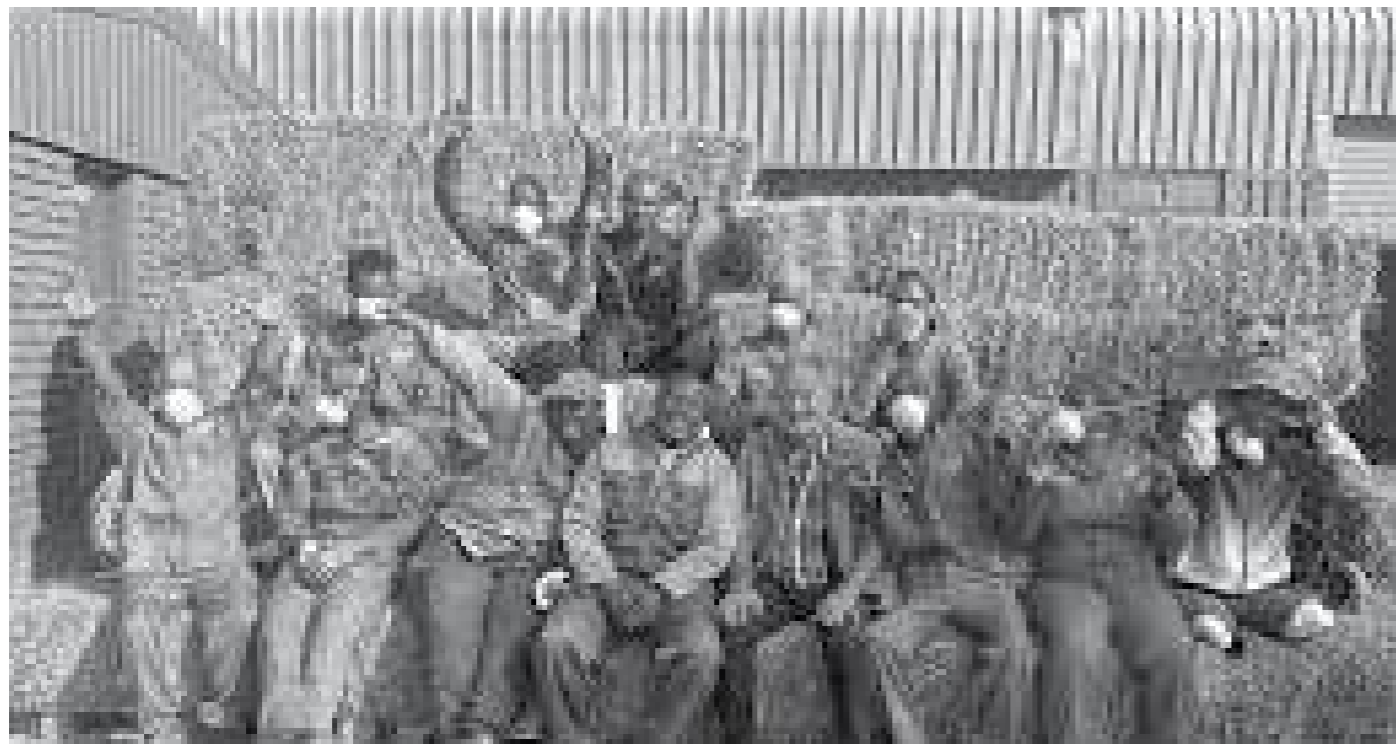
Jantjies Voere founder and his employees