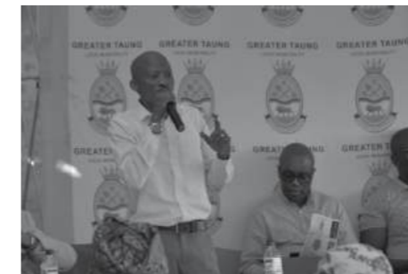
The Mayor takes the public through IDP