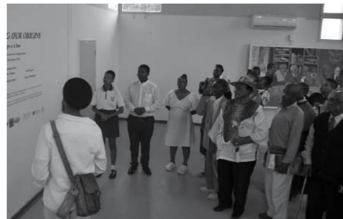
Some of the Visitors at the Kano Creative Arts Exhibition

Reimagining Our Origins is also a platform for artistic dialogue and expression. Artists have explored creative styles by incorporating the use of various recycled and natural materials.