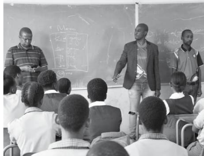
Engagement with learners during 'Right to Learn' campaign

As it has been practiced over the last two years Mayor Tumisang Gaoraelwe embarked on a campaign to encourage the learners around Greater Taung to embrace their right to learn and acquire skills for meaningful participation in the economy.