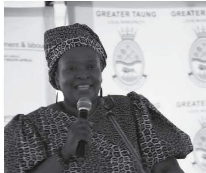
Deputy Minister of Employment and Labour, Boitumelo Moloi