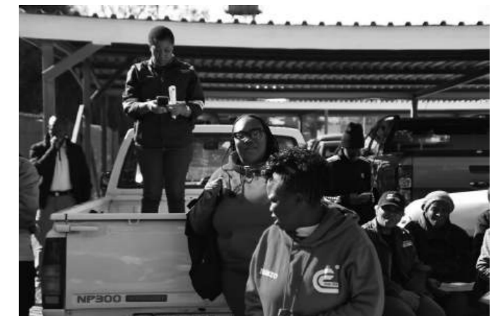
The Mayor spent 67 Minutes Working at Taung Hospital Vegetable Garden