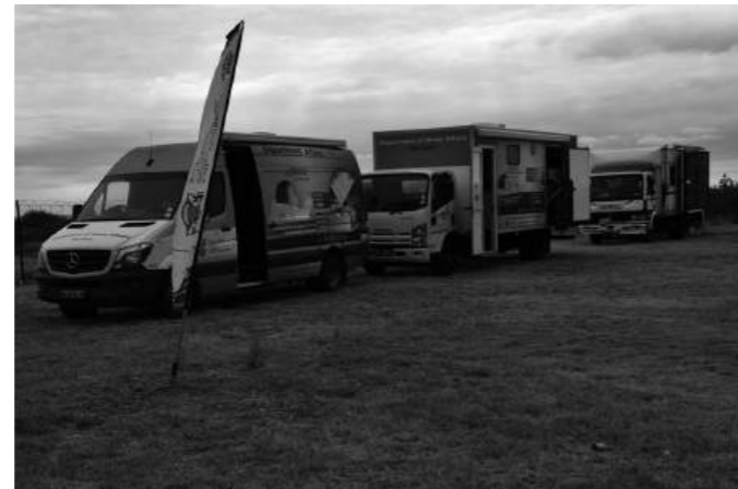
Service Delivery Mobile Units

Residents attended these meetings in numbers to access different government departments' services