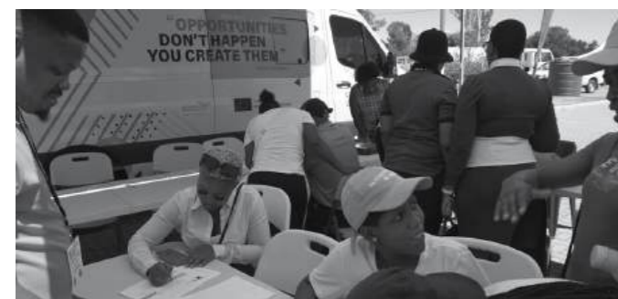
Career Exhibition Visitors