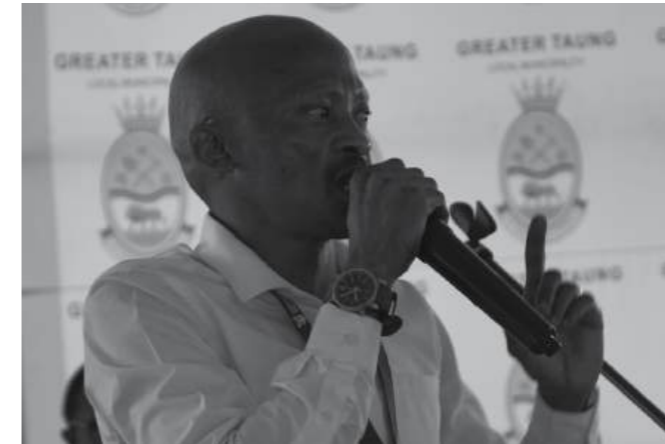
Mayor Tumisang Gaoraelwe

The former MEC of Department of Social Development Lazarus Mokgosi (current Premier of the North-West Province) advised entrepreneurs on the importance of hard work and commitment as importance building blocks for success in business. The former MEC encouraged small businesses to take advantage of opportunities created by government to grow their businesses.