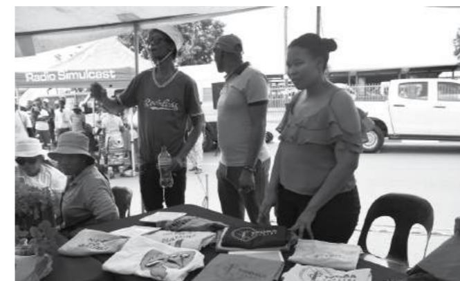
Exhibitors at the event

Participants from across Dr Ruth Segomotsi Mompoti. Some came from as far as Ganyesa while some came from Taung. Apart from school uniforms, there were hand-made clothing, hats, jewelry and many other items and services.