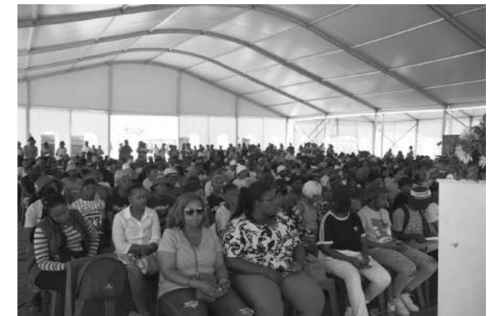
Career Exhibition attendees