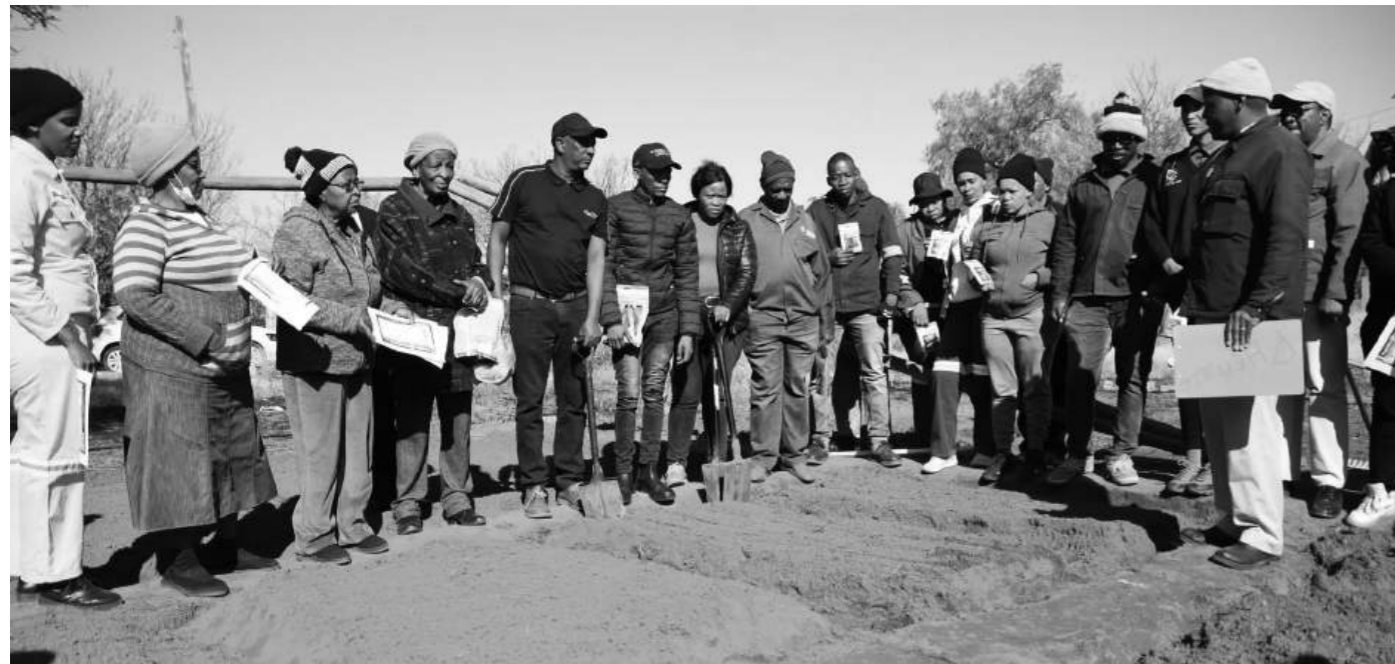
The Mayor and Leadership of Taung District Hospital on Mandela Day

Other participants include TDH staff and Retired Nurses, Taung Agricultural College, Department of Agriculture and Rural Development and Chivas Crew