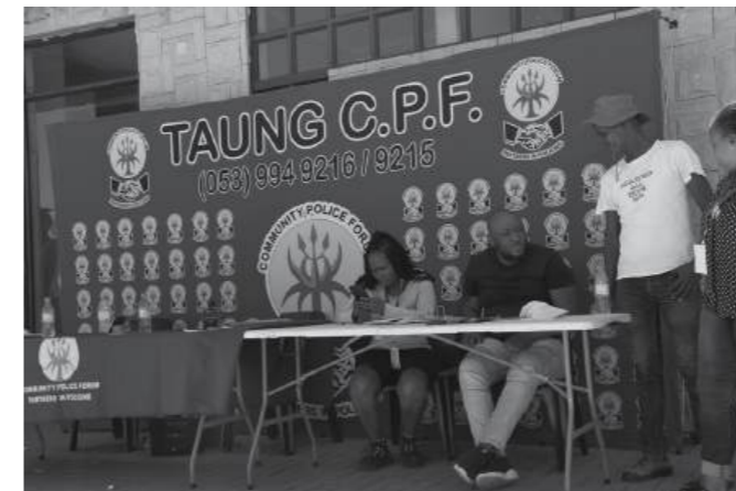
Exhibitors at the event