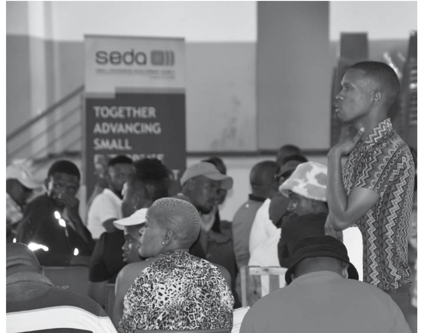
Greater Taung SMME's

The Small, Medium and Micro Enterprises sector has been identified as an important strategic sector in the overall policy objectives of the Government of South Africa and it is seen as a driver of change for inclusive economic growth, national development, employment creation and poverty reduction.