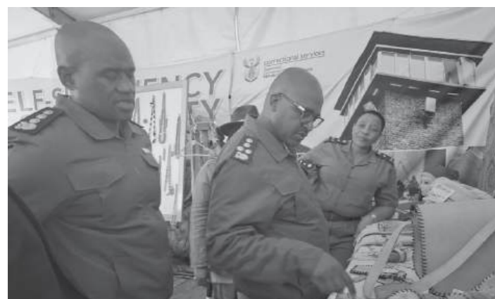
Correctional Services officials