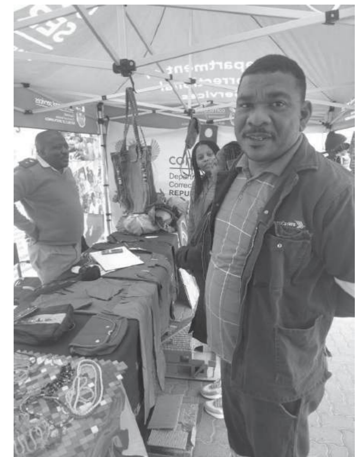
Exhibitions at the Correctional Services Imbizo