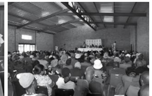
Community members at the public participation meeting

The communities during Mayoral public participation lodged their grievances which were dominated by the following: