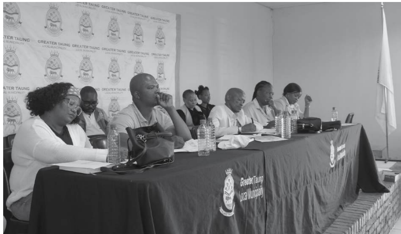
Mayor Gaoraelwe and other Councillors

The Mayor further expressed satisfaction for the manner in which communities attended meetings. "Government will not be able to succeed in improving the citizens' quality of life without the active participation of the communities and other role-players. We need active citizenry in order to deepen our young democracy", concluded the Mayor.