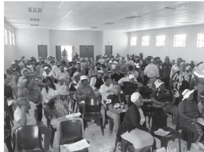
Community members at the public participation meeting

The Mayor expressed his appreciation for the efforts of Sector Departments that made efforts to attend, and further encouraged others to prioritise such meetings. "We all have a responsibility to consult, listen and respond to the concerns of our communities", said the Mayor.