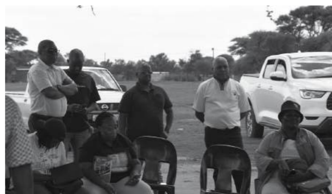
Itireleng Community in attendance