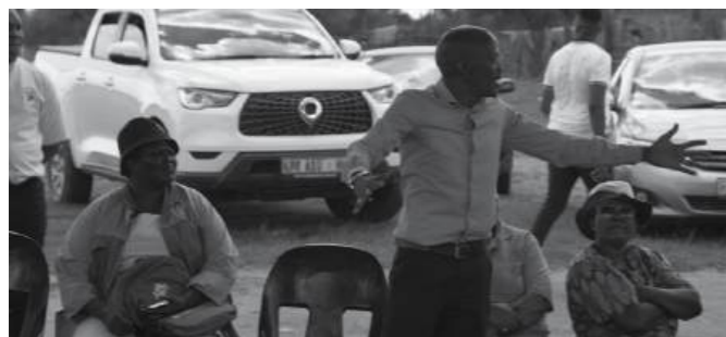
Mayor Addressing the Community of Itireleng Village