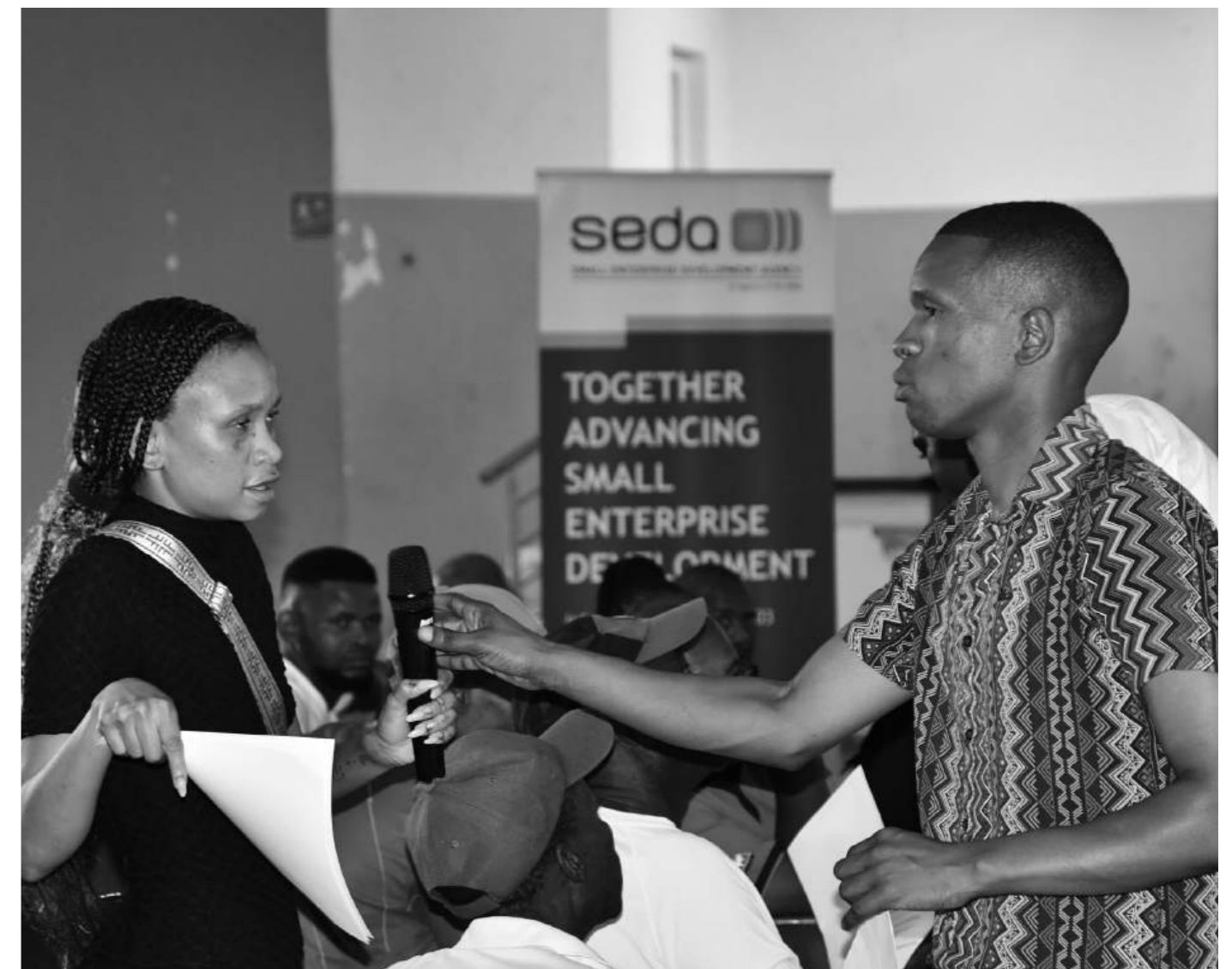
Young People in Engagement with SEDA