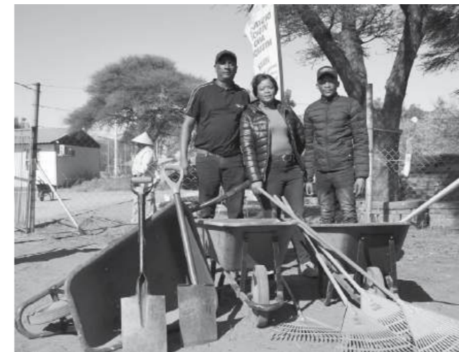
The Mayor at Taung Hospital for Mandela Day

The United Nations has declared 18th July as International Mandela Day in 2009, four years before the late president's passing. This was in recognition of the contribution of the first State President of the democratic order in South Africa, Nelson Mandela. The intention of the declaration is to encourage the citizens of the world to give and thereby assist in uplifting the less privileged members of the communities and organisations to reflect on Mandela's legacy, celebrate his values and principles.